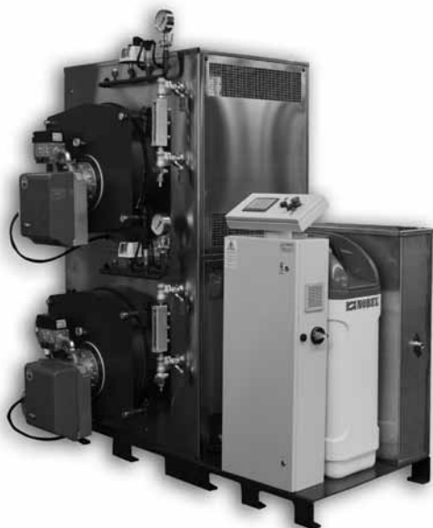
Image refers to the DUAL version with equipped floor kit